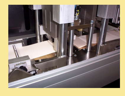
UTRASUONIC WELDING HEADS