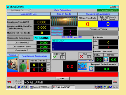
DATA INPUT PAGE