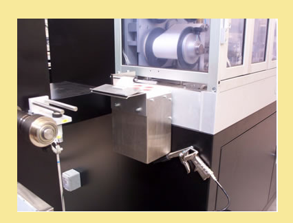
FABRICS FAULTS DETECTOR